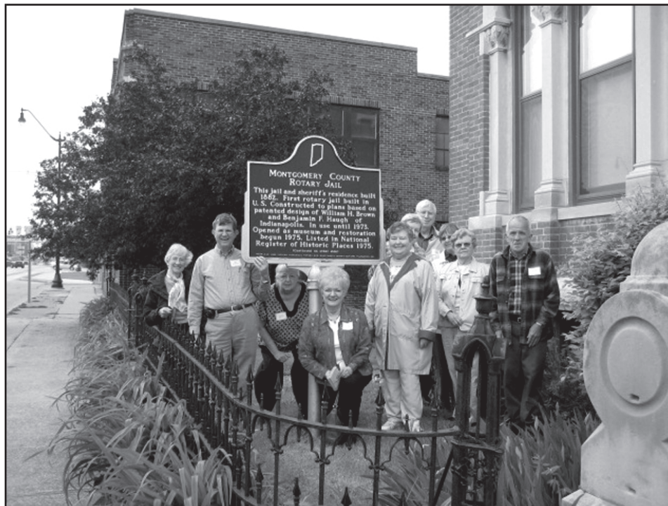
Retirees visited the Old Jail Museum (above) and the General Lew Wallace Study & Museum (below) in May. The trip to Crawfordsville also featured the Henry Smith Lane historic home. The group had lunch at Creekside Lodge Restaurant & Lounge.