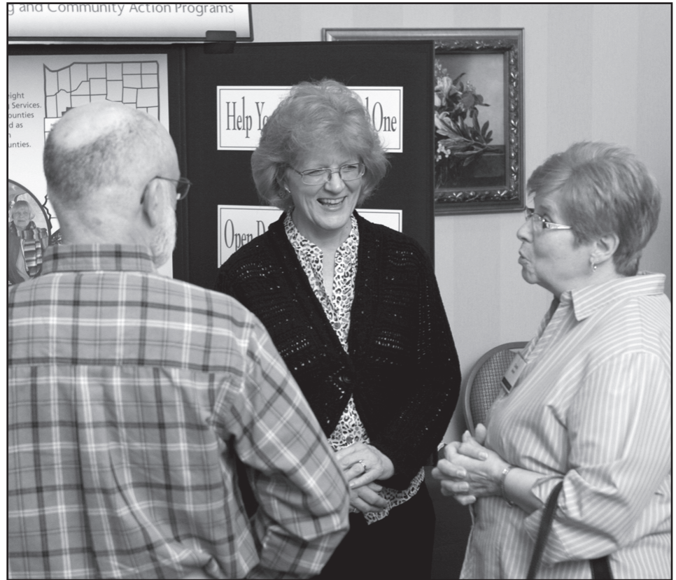
Retirees and community members who attended the "Purposeful Living in Retirement" conference in April were able to talk with several service providers and exhibitors about items related to living as retired citizens. PURA members also had the opportunity to attend presentations on topics such as proper nutrition, living actively through gardening and how to face today's economy.