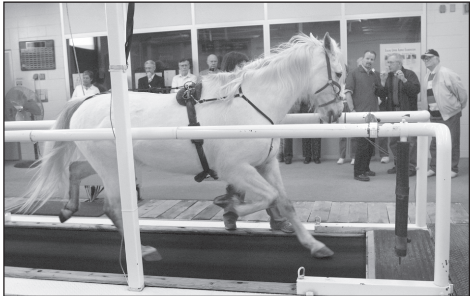
Retirees visited Purdue's Large Animal Hospital in April, where they saw a demonstration of the high-speed equine treadmill in the Equine Sports Medicine Center.

Students, veterinarians of the state and the animal-owning public are the benefactors of the School of Veterinary Medicine.